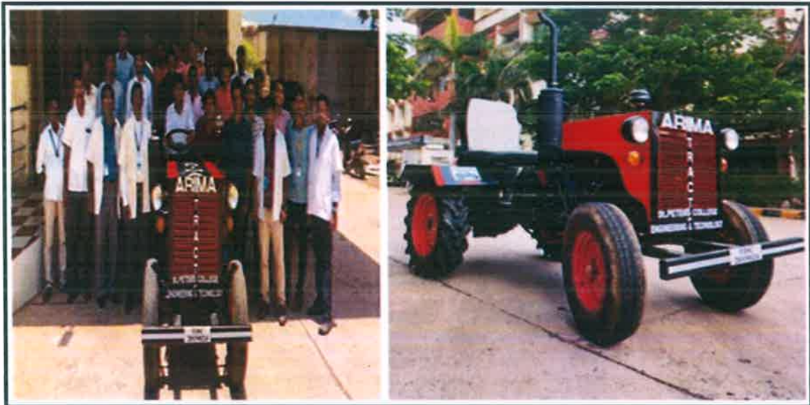
Tractor design and developed by SAE club students.