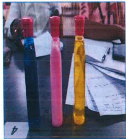
Entrepreneurship day Activities